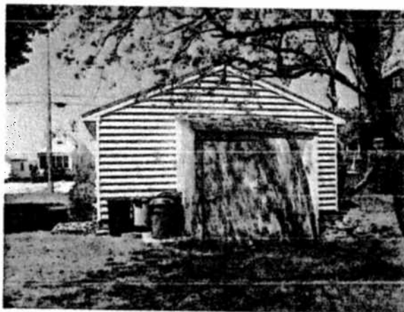
REAR VIEW 5/15/2013